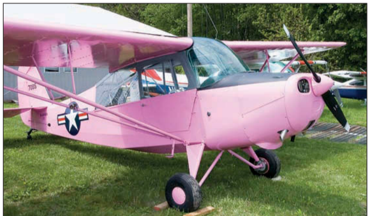
This Aeronca 7BCM saw duty in the Korean conflict as an L-16A liaison plane and is one of 509 manufactured for the U.S. Army in 1947.

Doylestown Airport held its fourth annual Celebration of Flight community open house Saturday. The event marked the 80th anniversary of the airport, which began operation in 1928. Entertainment, free rides and free food highlighted the sunny day. The open house included a crowd pleasing radio controlled aerobatics demonstration. Among the planes in the antique aircraft fly-by were two yellow Stearman biplanes and an unusual Avions Max Holste MH1521M Le Broussard .