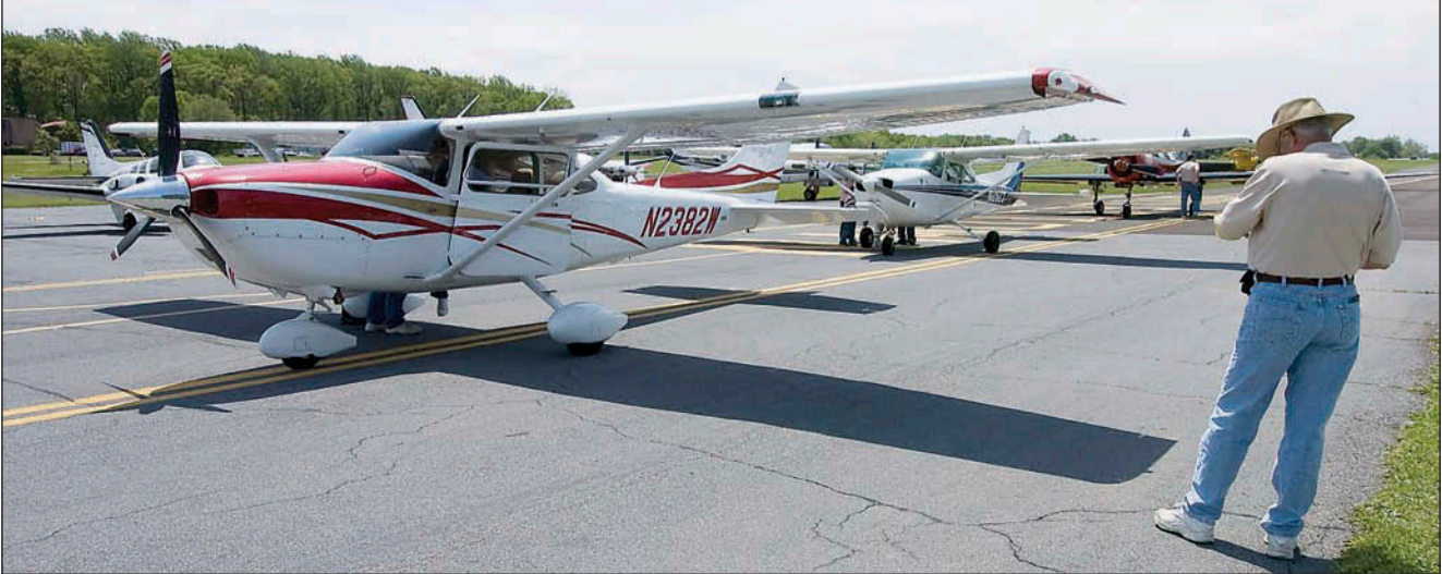
A line of aircraft prepares to take up eager passengers for a 20 minute ride over Bucks County...